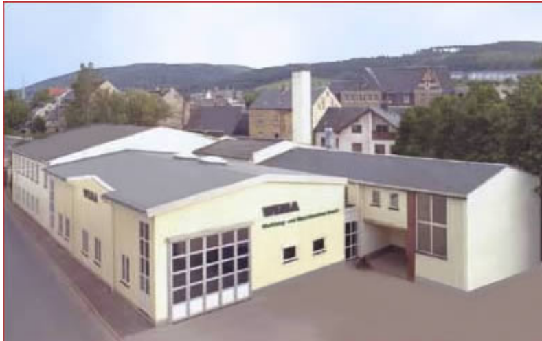
The company building in Olbernhau.

In 1994 we extended our works to accommodate an increased production. In the year 2000 we built a new assembly hall together with a new showroom, a training-room and a large parking area for customer.