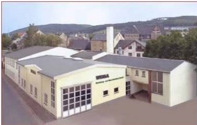
The company building in Olbernhau.

In 1994 we extended our works to accommodate an increased production. In the year 2000 we built a new assembly hall together with a new showroom, a training-room and a large parking area for customer.