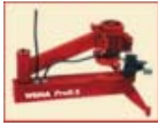
Profile sharpening machine with diamond grinding wheel.