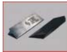
profile cutters (V form)