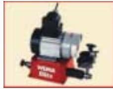
Sharpening machine, type BLITZ, for sharpening standard copying lathe tools (i.e. pointed tools). The double clamping device & precision depth adjustment warrant quickspeed resharping with a constant knife geometry.