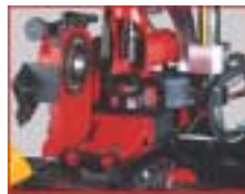
By use of 2 copy carriages, turning and milling can be made in one mounting.