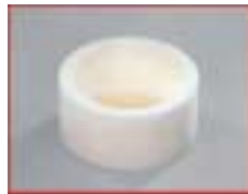
cup grinding wheel for WEMA BLITZ