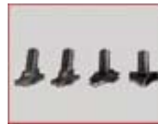
set of profile cutters, 4 items