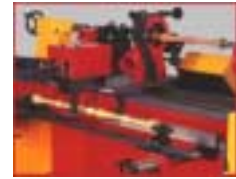
Rear view of machine with double scanning system, ball transfer guides on lathe base, feed motor, energy guide chain, template support with master pattern scanning and adjustment mechanism.