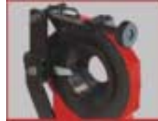
ring follower steady 15-75 mm or ring follower steady 80-130 mm with quick interchangeable discs