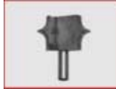
Radius milling head