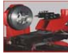
Four-jaw collar plate, infinitely variable.