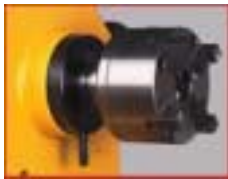
Four jaw chuck