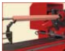
program-controlled pick-and-place unit