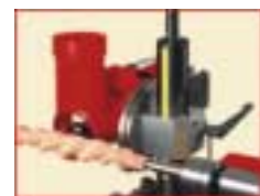
Milling unit with horizontal cutter head