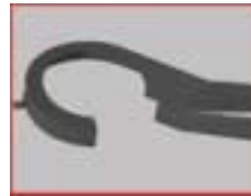
extraction for ring follower steady