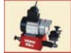
Sharpening machine, type BLITZ, for sharpening standard copying lathe tools (i.e. pointed tools).