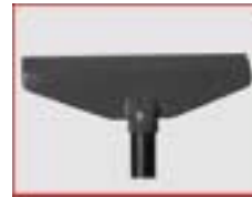
Tool rest 180 mm / 275 mm / 425 mm