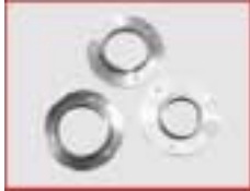
Special insert discs for steady