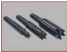
profile cutters (pointed)