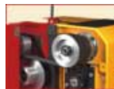
new drive system for high power transmission