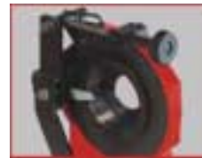
ring follower steady 15-75 mm or ring follower steady 80-130 mm with quick interchangeable discs