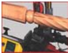
Milling unit with vertical cutter head.