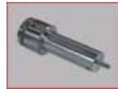
disk chuck long d 45 mm