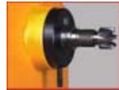
six pronged dog short