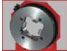
Four jaw steady infinitely adjustable in 3 dimensions 30-60 mm, 60-100 mm, 120-180 mm