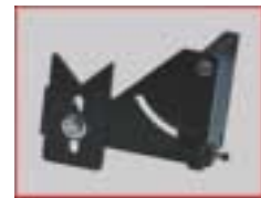
feeding device for steady