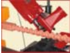
Milling unit with vertical cutter head