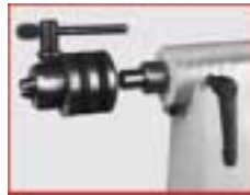
Live centre MT2