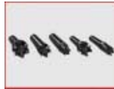
Drive chuck d 20 mm, 30 mm, 40 mm