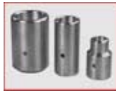
Socket chuck d 20, 30, 40, 50, 60