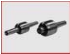
Live centre MT2 with ring