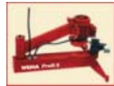
Profile sharpening machine with diamond grinding wheel and Sharpening machine BLITZ for copy lathe tools.