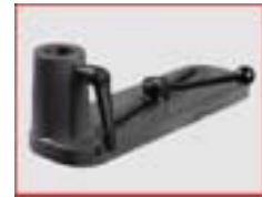
Tool rest holder