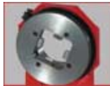
Four jaw steady infinitely adjustable in 3 dimensions 30-60 mm, 60-100 mm, 120-180 mm.