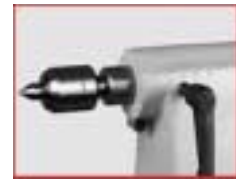
Live centre MK 2