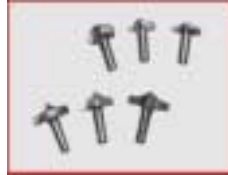
Ball-nose milling cutter