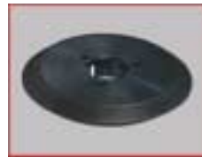
diamond grinding wheel for profile sharpening machine