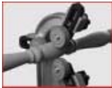
Steady support with swivel