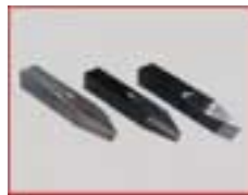
profile cutters (pointed)