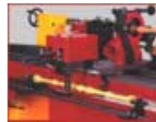
copying from original