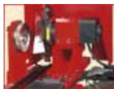
program-controlled tool changer with 4 tools