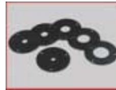
insert discs for steady