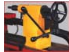
quick loading device