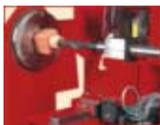
program-controlled drilling unit