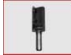
Flat milling head