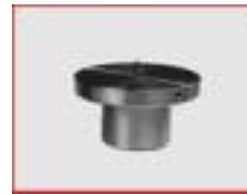
disk chuck d 90 mm