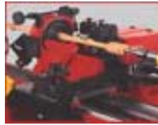
Ring collar plate with adjusting spindle, pointed tools on both copying supports, hand rest for manual reparting.