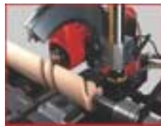
Milling unit with horizontal cutter head.