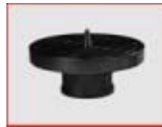
face plate d 200+300 mm