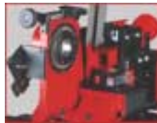
2 copy carriages for large cutting operations extraction for copy carriage.