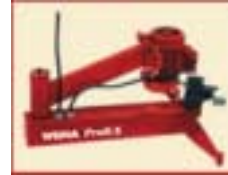
Profile sharpening machine with diamant grinding wheel and Sharpening machine BLITZ for copy lathe tools.